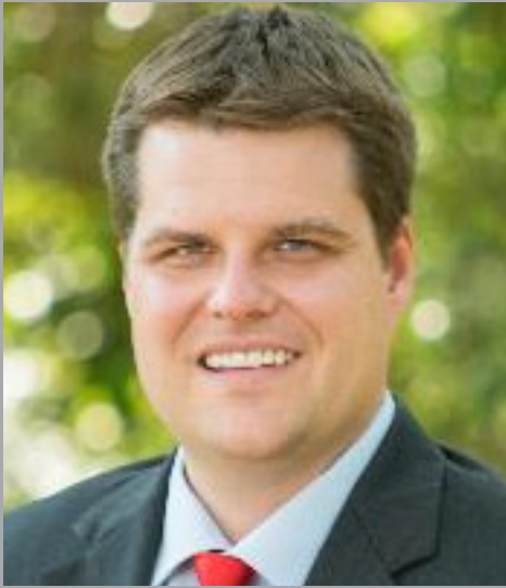
MATT GAETZ (R-FL, Incumbent, Won)

U.S. HOUSE OF REPRESENTATIVES, 1ST DISTRICT (WESTERN PANHANDLE)