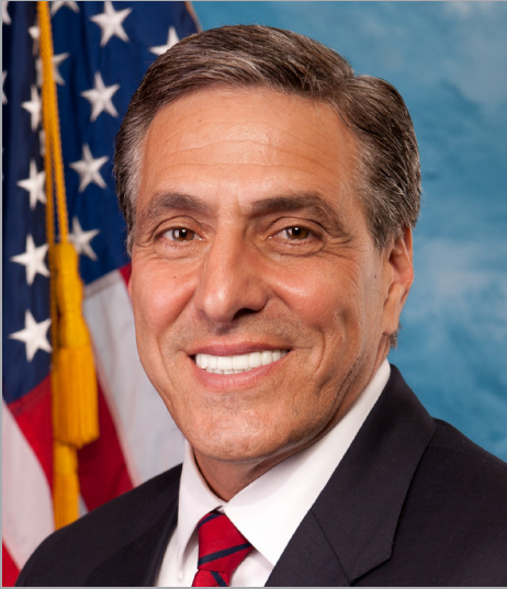
LOU BARLETTA (R-PA, Challenger, Lost)

LOST HIS RUN FOR SENATE IN 2018 WHILE SERVING AS CONGRESSMAN FROM PENNSYLVANIA'S 11TH