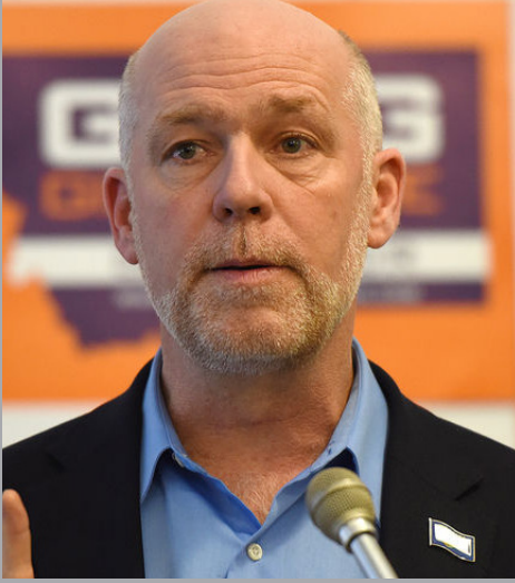
GREG GIANFORTE (R-MT, Incumbent, Won)

U.S. HOUSE OF REPRESENTATIVES, MONTANA'S AT-LARGE CONGRESSIONAL DISTRICT